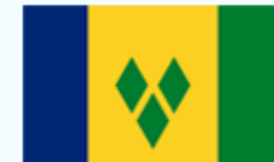
St. Vincent and the Grenadines