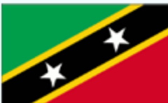
St. Kitts and Nevis