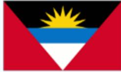
Antigua and Barbuda