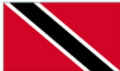
Trinidad and Tobago